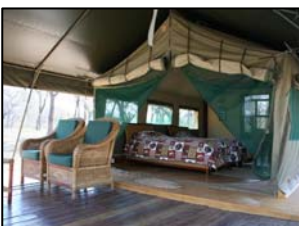
Majete Game Reserve

You will be driven back to Lilongwe and once again stay overnight at Heuglin's Lodge.